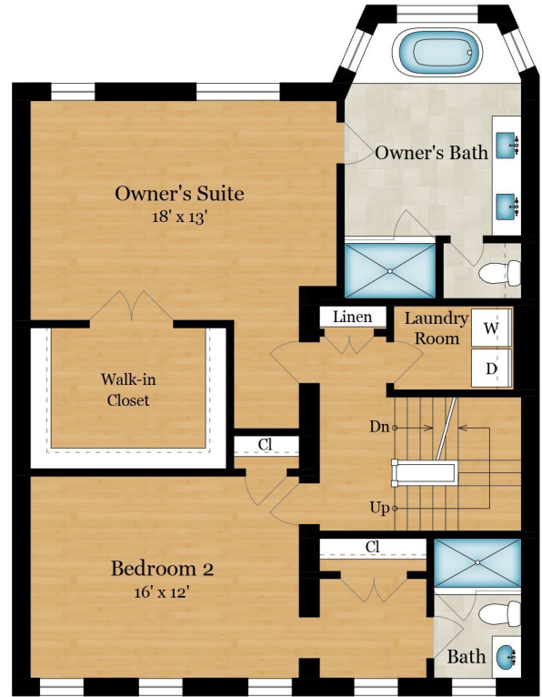
UPPER LEVEL 1 1,160 SQ FT