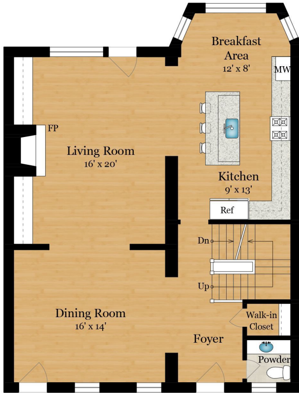
MAIN LEVEL 1,170 SQ FT